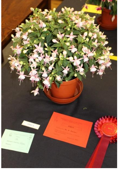
Malcolm's entry in Class 13 – 5" pot any cultivarof Ginny B.