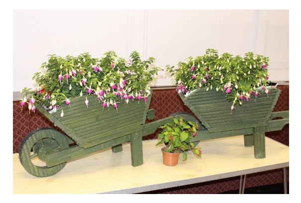
Dave Jupp's wheelbarrows went unrewarded as they were 'not as schedule'.