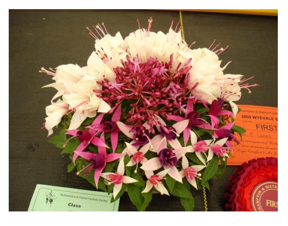
Pat Leahy's glass bowl of fuchsia flowers