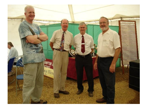
Enjoying a break in the proceedings